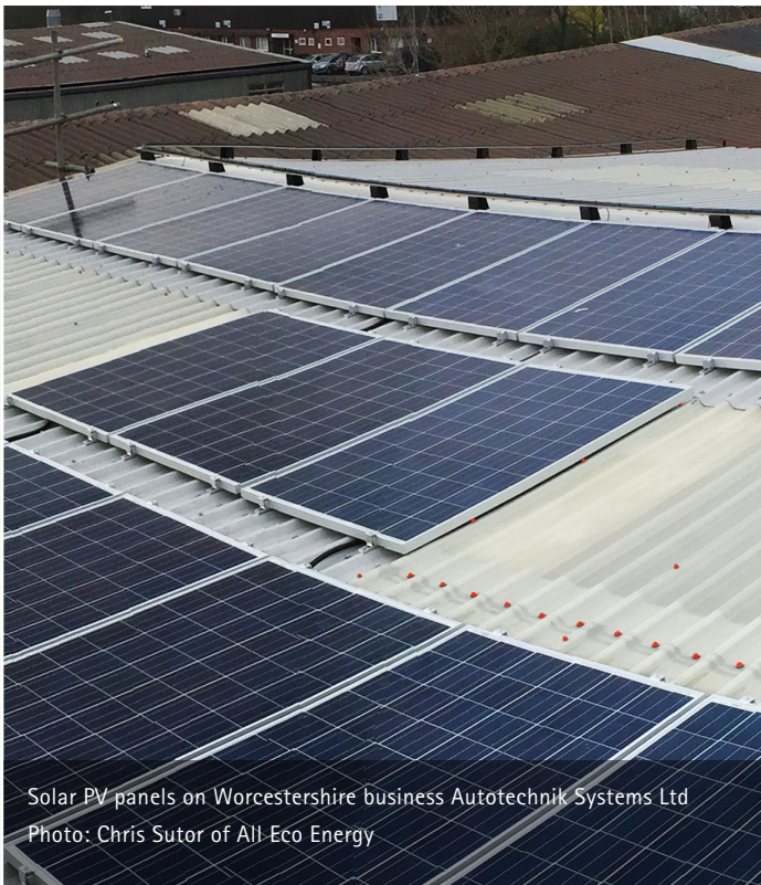
Solar PV panels on Worcestershire business Autotechnik Systems Ltd

The Low Carbon Opportunities Programme can provide grants of up to 45% of the total cost of a project (to a maximum contribution of £100,000 for capital, £50,000 for revenue) for businesses to install renewable energy systems or undertake low carbon innovation projects.